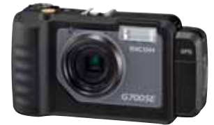
G700 SE Camera