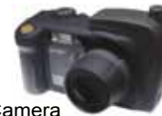
500 SE Camera